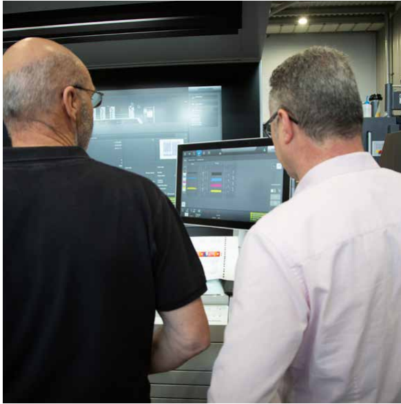
Denny Bros create print output using a Heidelberg XL 75 Anicolor and GMG software to ensure accurate color results.